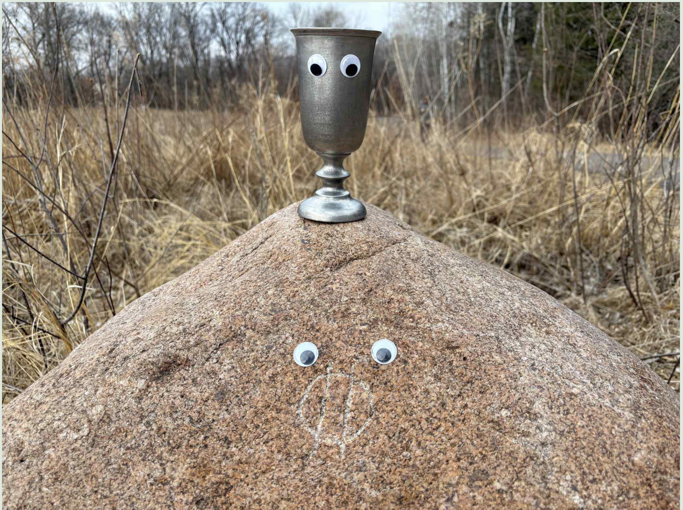
Photo: Oakdale Grove's Druid Sigil-inscribed stone, moved from our oak grove to the paved trail around 2020 during prairie restoration, probably because it had a mysterious carving on it. I had to use pine sap for glue because I realized too late that the googly eyes were not self-adhesive. In the end, my phone was covered in sappy fingerprints!