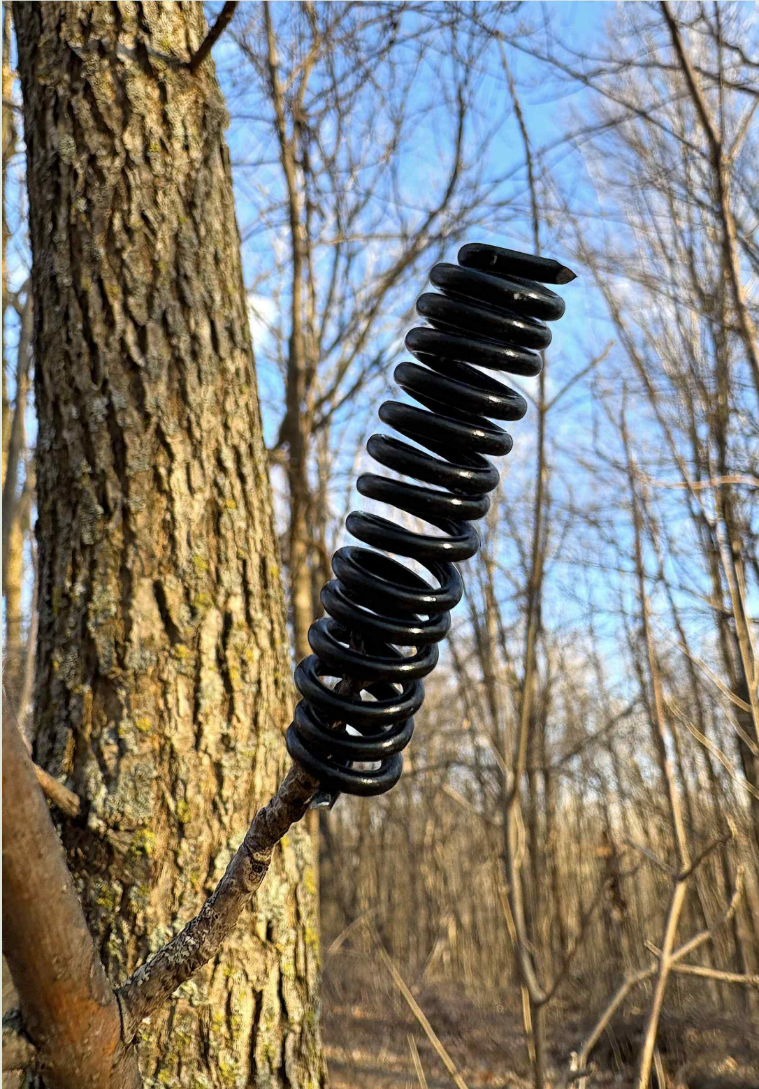
A Spring Tree.

A very special thank you photograph dedicated to everyone who contributed to this article!